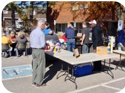
Outdoor BBQ hosted by the Men