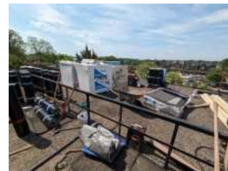
new roof supplies now on site