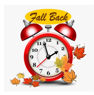
Set your clocks back 1 hour!