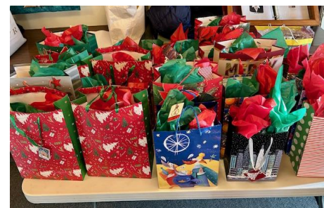
Items were put in bags, and then finished the bags for Cornerstone