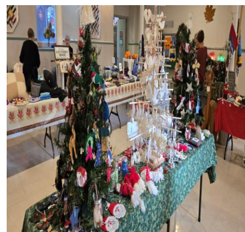
Harvest of Crafts Sale