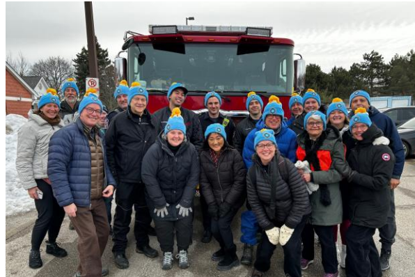
Streetsville United Church Walkers and some Mississauga Firefighters